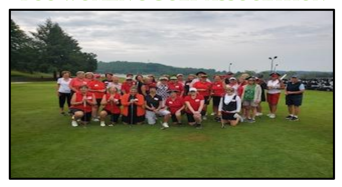
BCC WOMEN'S GOLF ASSOCIATION

The Women's Golf Association is anxiously looking forward to the beginning of the 2024 golf season.