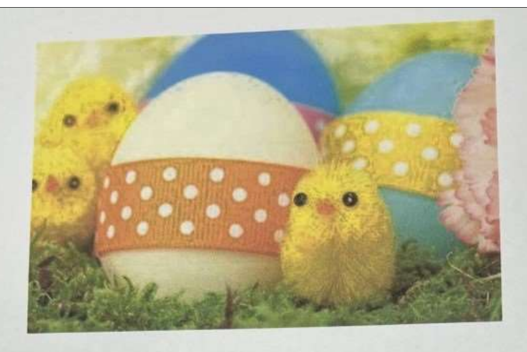
EASTER BUFFET SUNDAY APRIL 9, 2023 11:00 - 2:00 $22.99 ADULTS - $9.99 KIDS

PASTA SALAD PASTA SALAD DEVILED EGGS POTATO SALAD MAC N CHEESE FRUIT GREEN BEANS HONEY GINGER CARROTS BAKED HAM GRILLED SALMON HERB ENCRUSTED CHICKEN DINNER ROLLS/ITALIAN BREAD ASSORTED DESSERTS